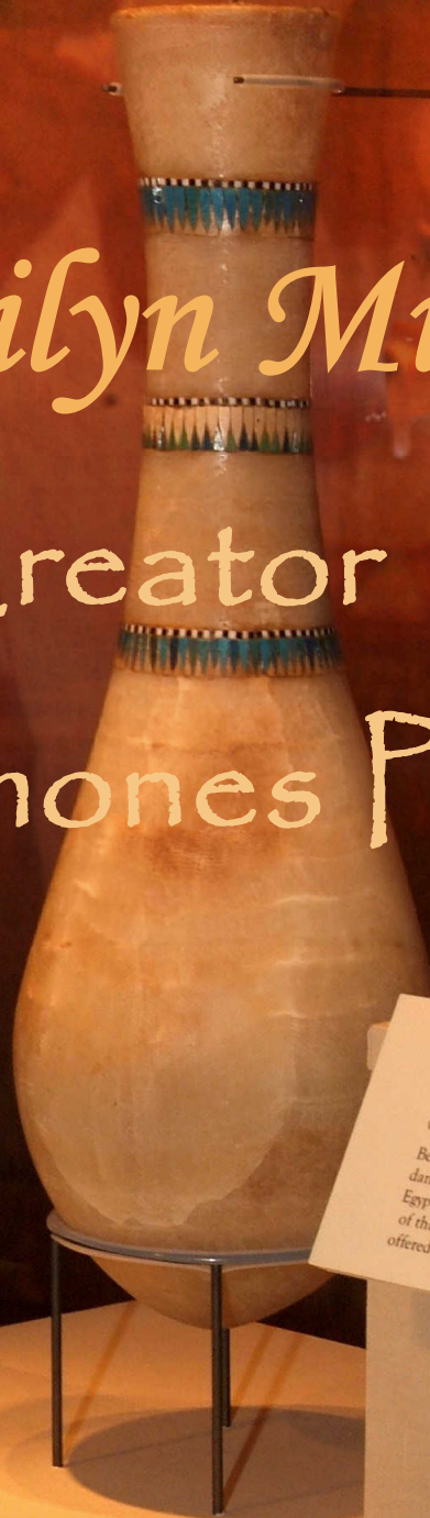
Unguent Vessel in the Form of the God Bes

Faience Reign of Akhenaten/Tutankhamun (1351-1327 BCE) Valley of the Kings, tomb 55