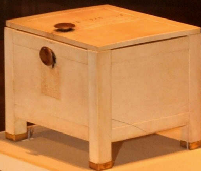
Chest for Jewelry

Ivory, gold Reign of Tutankhamun (1332-1327 BCE) Valley of the Kings, tomb 62